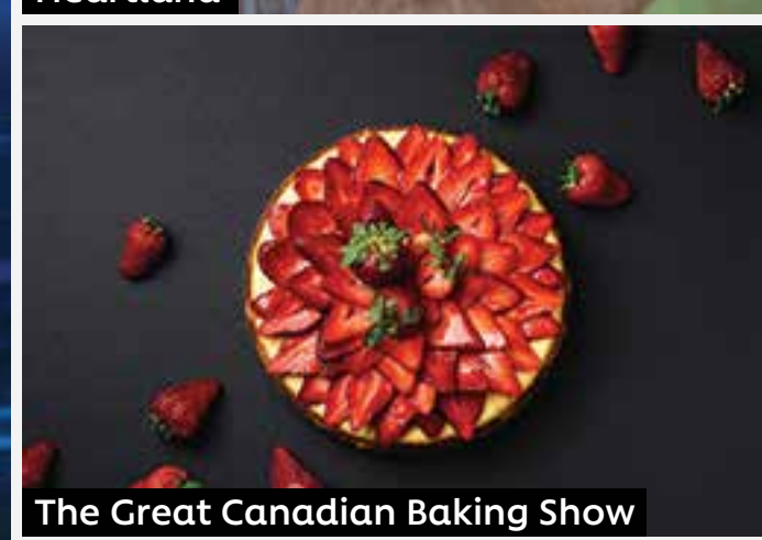
The Great Canadian Baking Show