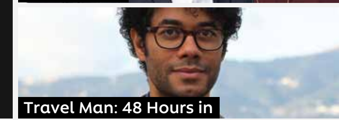
Travel Man: 48 Hours in