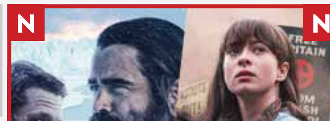
The North Water